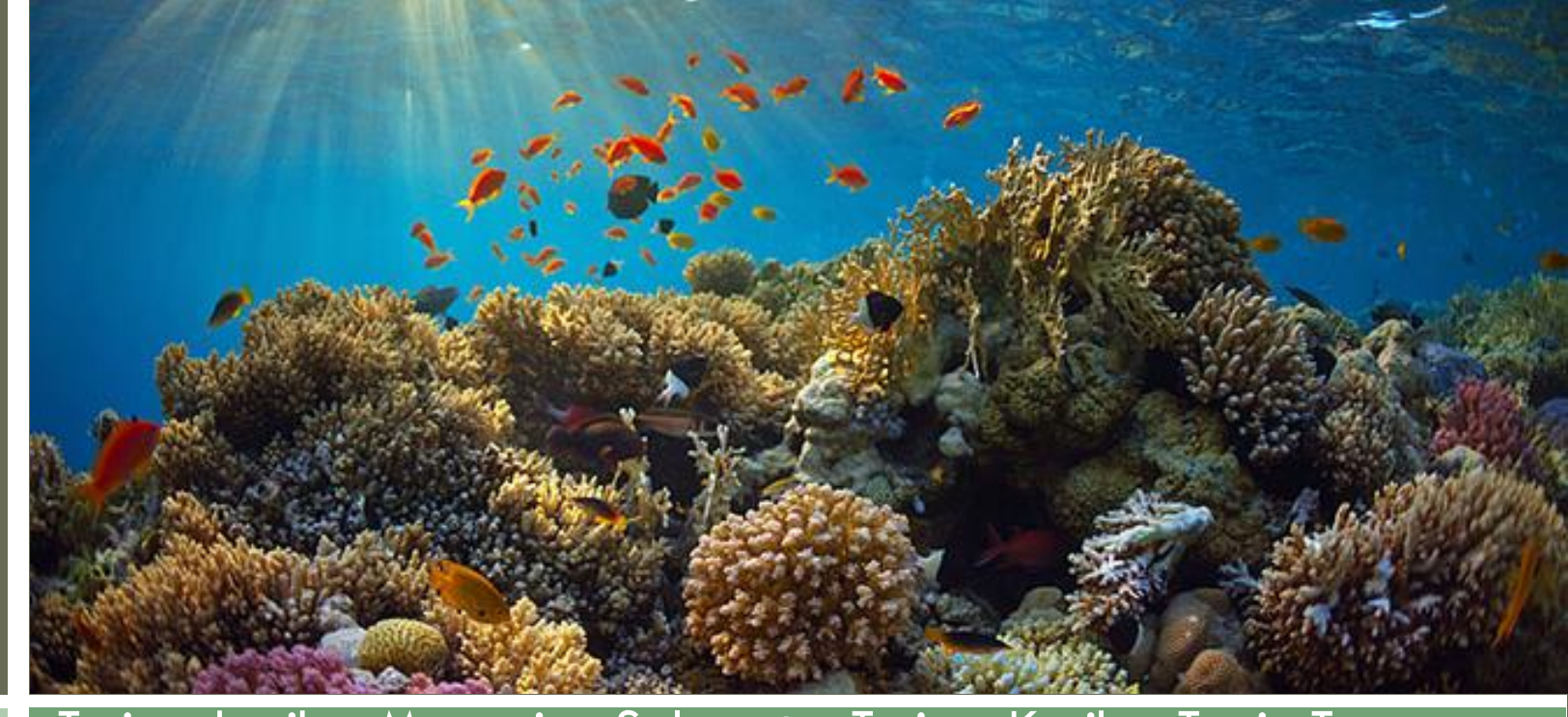
Terima kasih — Maraming Salamat — Terima Kasih — Tagio Tumas — Obrigado – Tank iu